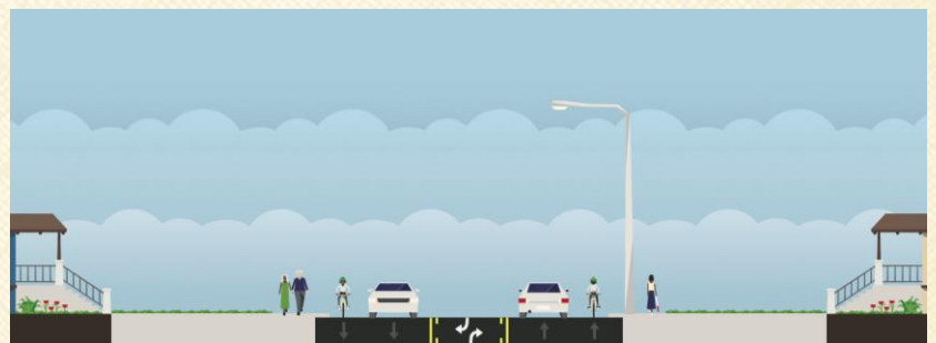
HUBBARDS LANE - PROPOSED